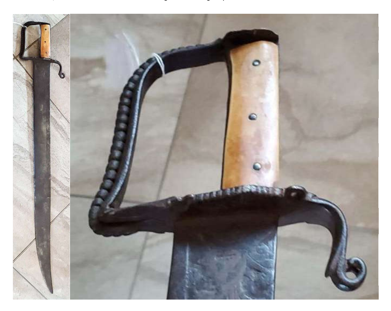
FIGURE 9: Heavy bladed espada ancha of late 18th century and Santa Fe provenance. The horn grips, now absent, are replaced with bone grip plates. This is the form shown in the illustration in figure 1, at the beginning of this article, of a vaquero circa 1820s with one strapped to his saddle. A detailed image of the hilt shows the beaded knuckle bow, serrated vertical lunette on crossguard and ringed quillon terminal. Author's collection .

FIGURE 8: Espada anchas with heavy single-edged machete type chopping blades. The example on the top, mounted in iron, weighs 1 pound and 11 ounces and has a blade length of 19 inches. The knuckle guard has been broken away while an intact semicircular guard extends only to the right. The bottom example weighs just over 2 pounds and has a 22\frac{1}{2} inch blade. Lee Jones' collection .