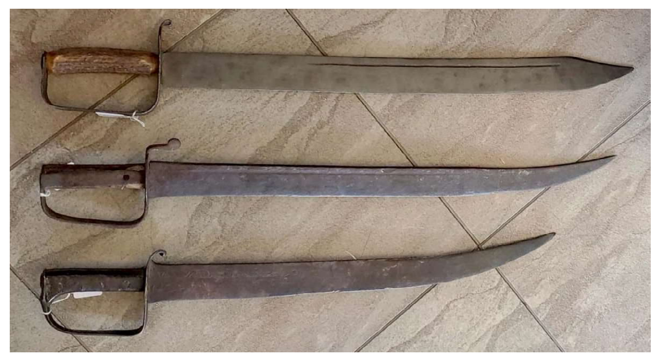
FIGURE 2: Grouping of espada anchas having the standard hilt styles with heavy blades seen throughout northern colonies in New Spain and the Borderlands from the 18th into the 19th centuries. The top example with a heavy blade is earlier; the second example in center has the blade with a slightly upticked point characteristic of the 1830s while the bottom example is shorter with a similar upticked point. These were the derisively called 'frog stickers' from about the 1840s. Author's collection .