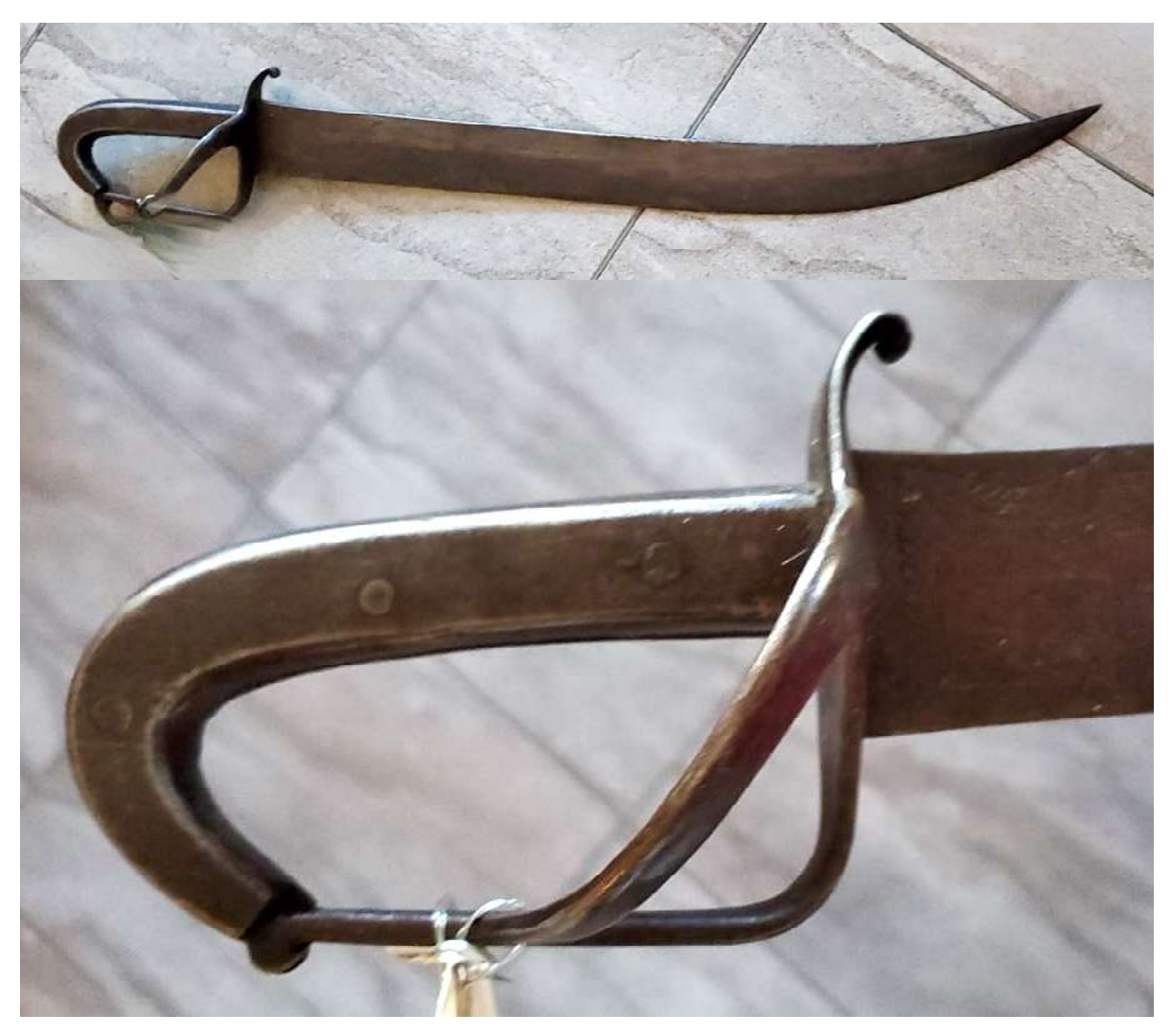
FIGURE 11: The Potosi type single branch guard and turnback pommel. This is a distinct variation from the standard espada ancha hilt of northern Mexico and the borderlands and probably influenced the later pommels of zoomorphic theme on knives from Oaxaca regions. The full length view shows the short heavy blade with uptick point that became well known in examples of espada ancha from the 1820s into the 1830s. Author's collection .

has been attributed to Spanish colonies in Florida or on the Gulf of Mexico, it is tempting to include it perhaps in the port areas of Vera Cruz. Its resemblance to seventeenth century cutlasses with large scallop shell guards suggests the possible mid eighteenth century period in form but without the shell. While the hilt is essentially an open guard, the crossguard has a vertically raised lunette with ribbing, a feature often seen on many espada ancha guards, which adds to the potential of this possibly being a version of the espada ancha.