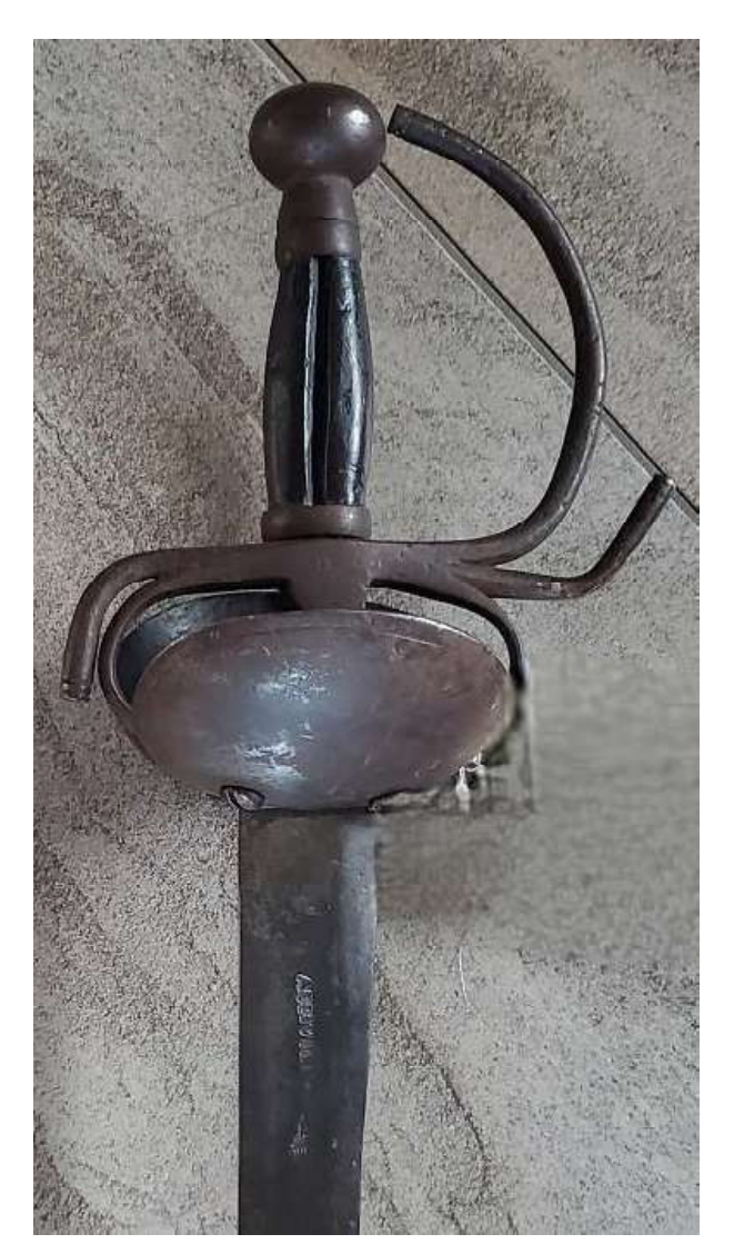
FIGURE 4: The Spanish regulation military sword M1728, typically known in English parlance as the 'bilbo' for the Spanish port of Bilbao, where Spanish swords and blades were often exported. These 'dragoon' broadswords used widely in the colonies were the source for the blades used in many espada anchas. Author's collection .

As the Spaniards explored northward in the early 17th century in the regions of New Spain (now Mexico) the use of these heavy bladed