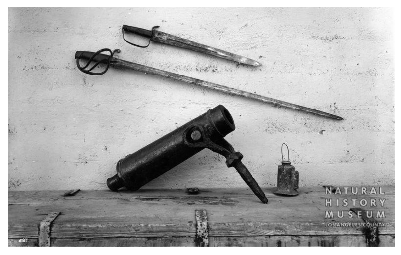
FIGURE 5: Swords from the Don Antonio Francisco Coronel collection with the upper example an espada ancha believed to have been with the Portola Expedition of 1769. The full size sword below it is Don Coronel's from circa 1850s.

in figure 6, along with an example of a Sonoran form machete, possibly quite like those also on the Portola expedition.<sup>7</sup> Clearly there were widely varying preferences for sword forms in the presidial regions of Mexico, and while the machete type heavy blade was typically preferred, in many cases the blades from regulation dragoon swords were used in these locally produced swords. It seems generally held that those mounted with somewhat altered regulation dragoon blades were produced in the later eighteenth century with the lengths of the blades varying, but often well exceeding the short sword definition with lengths often up to 28 inches. The example shown in figure 7b is one of these noted with