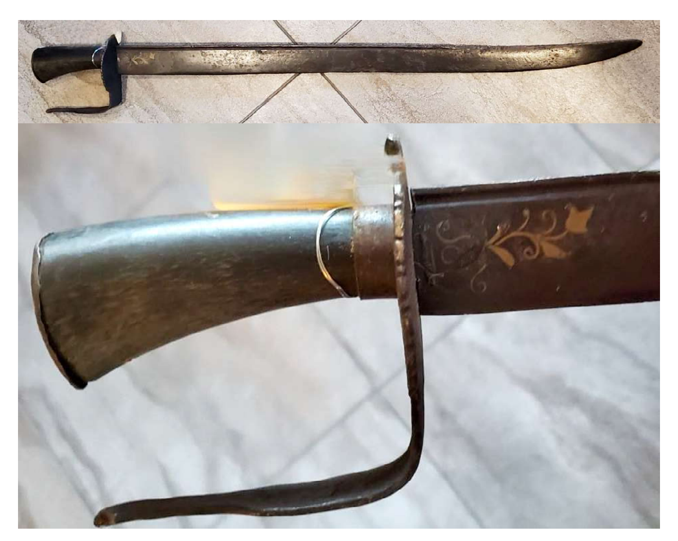
FIGURE 10: An espada ancha/cutlass of mid eighteenth century from Spanish colonies from Florida to the Gulf of Mexico coast, perhaps as far as Vera Cruz. The horn hilt resembles many seventeenth century maritime cutlasses, but instead of the scallop shell guard, is has a simple guard with raised lunette at cross guard and open knuckle guard that does not reach the pommel. The heavy blade has astral symbols, as often typically seen on Solingen blades, but with a yellow metal flower design inlaid on the forte, in Spanish style. Author's collection .

shipboard utility as well as for combat and as well ashore in clearing vegetation and other utility functions. While Santa Fe in the North had other contacts from regions to the east in trade, it is, of course, possible that a degree of evolution there derived from the various types of hunting and military hangers that came in with traders in addition to the influences from the south in those caravans from Mexico City; however, the machete remains the strongest contender for the ancestry of the espada ancha.