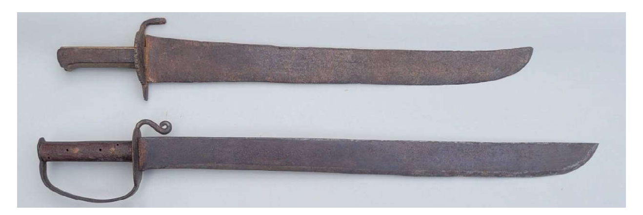
FIGURE 8: Espada anchas with heavy single-edged machete type chopping blades. The example on the top, mounted in iron, weighs 1 pound and 11 ounces and has a blade length of 19 inches. The knuckle guard has been broken away while an intact semicircular guard extends only to the right. The bottom example weighs just over 2 pounds and has a 22\frac{1}{2} inch blade. Lee Jones' collection .

FIGURE 9: Heavy bladed espada ancha of late 18th century and Santa Fe provenance. The horn grips, now absent, are replaced with bone grip plates. This is the form shown in the illustration in figure 1, at the beginning of this article, of a vaquero circa 1820s with one strapped to his saddle. A detailed image of the hilt shows the beaded knuckle bow, serrated vertical lunette on crossguard and ringed quillon terminal. Author's collection .