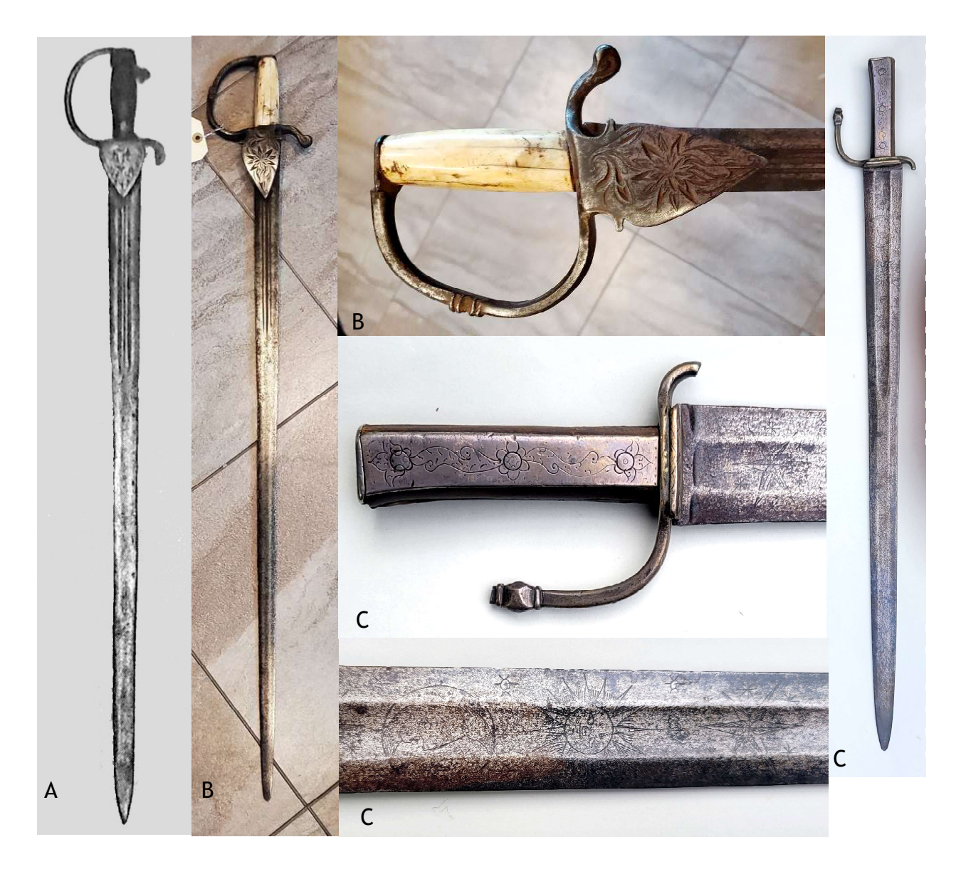
FIGURE 7: Examples with double-edged sword type blades mounted with typical espada ancha knuckle guards.

A. The 'Avila' sword used by Don Jose Maria Avila at the Battle of Cahuenga Pass near Los Angeles where he was killed December 5, 1831, as shown in The Leather Jacket Soldier , Odie Faulk and Sidney Brinckerhoff, noting the use of these 'dragoon blades in many of these.' The blade is 28 3/8 inches long with three short fullers. Also note the florally decorated shield langet similar to the hilt on example B. Seaver Collections for Western Historical Research at Los Angeles Museum of Natural History .