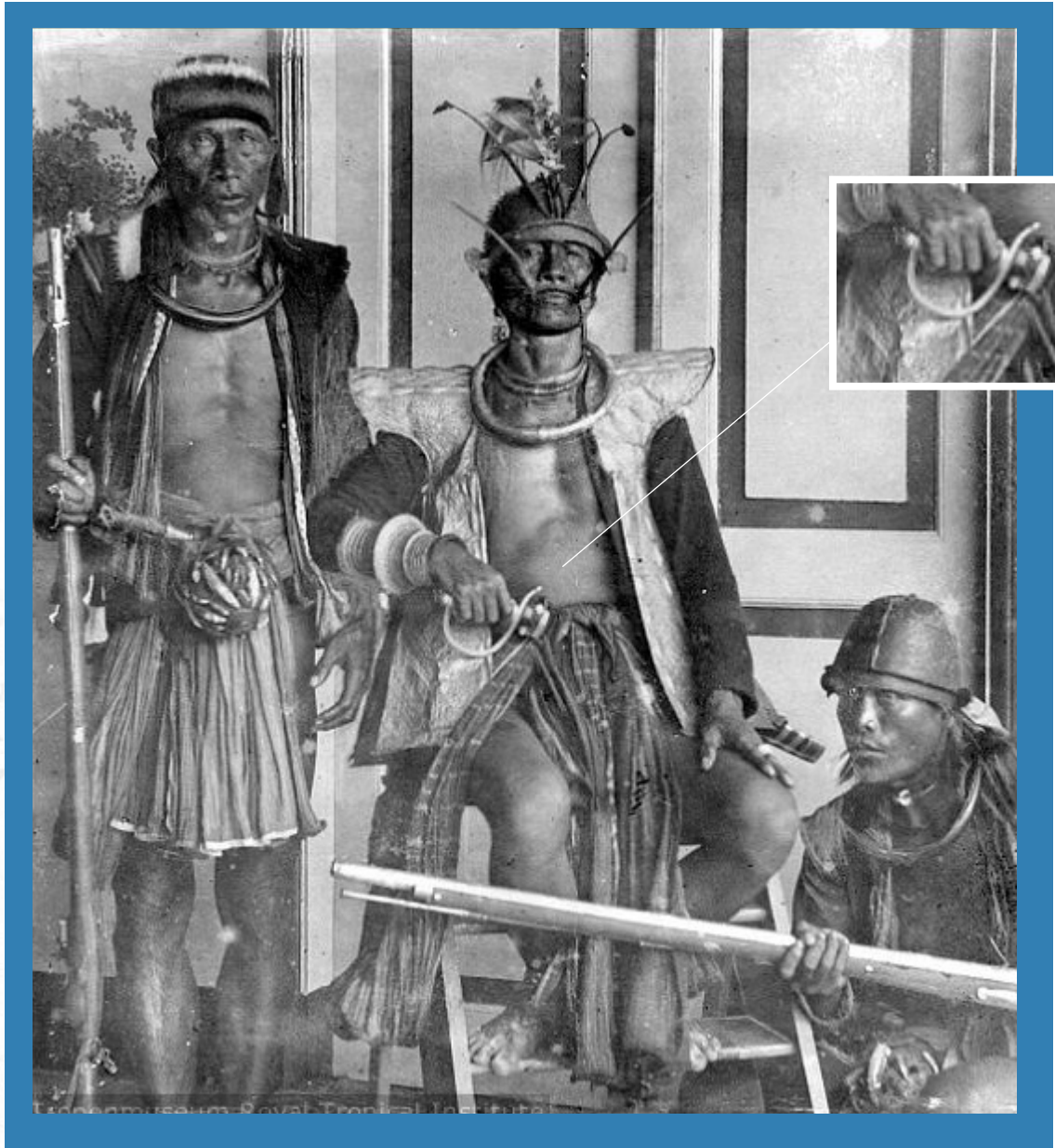
Nias chieftain with a European hilted sword, but likely a native made blade.